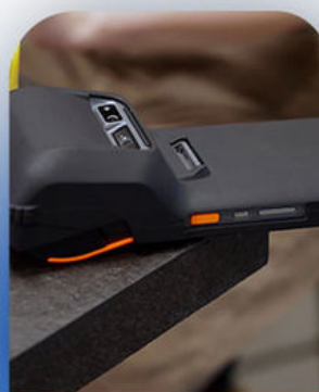
Silicone protective case

The Android POS Terminal is a versatile product that offers multiple languages support for businesses worldwide. With a battery capacity of 7.7V/3000mAh (equal to 3.85V16000mAh), this product is perfect for catering, retail stores, transportation, and lottery applications. Equipped with 2GB RAM +16GB ROM or 3GB RAM + 32 GB ROM, this terminal POS Android product provides ample memory and storage capacity to handle your business transactions efficiently. The Android POS terminal with label printer comes with either 16GB or 32GB of storage space to store all your data and information.