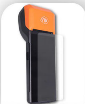
Gift-High Quality Screen Protectors Dust-proof and explosion-proof

Optional Customized Silicone Protective Case & Strap Better Price if Purchase together with H10 pos