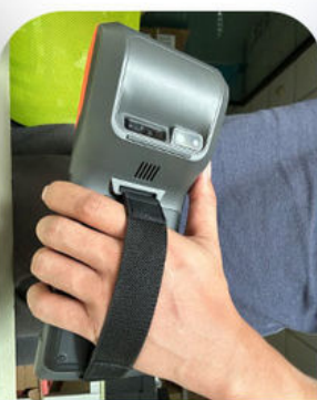
Braided Leather Wrist Strap