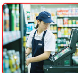
3. Convenience Store