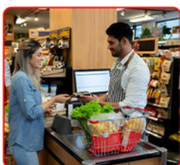
1. Supermarket cashier