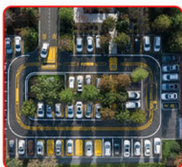
4. Parking System