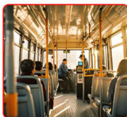
5. Bus Ticketing