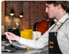
Delivery Order Management