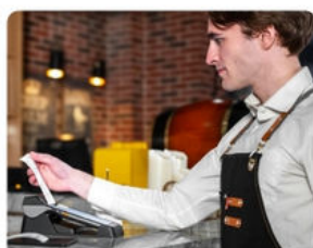
Delivery Order Management