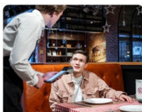
Mobile Ordering Excellence